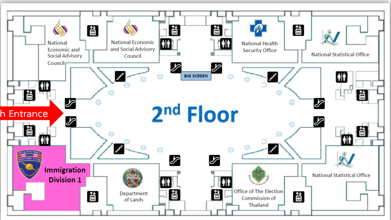
2 nd Floor of Building B