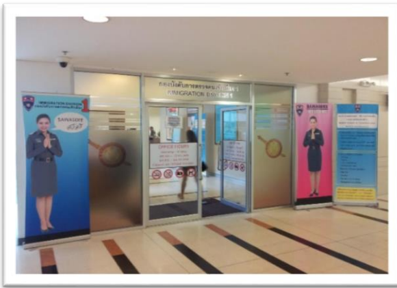
The Immigration Division 1 Office